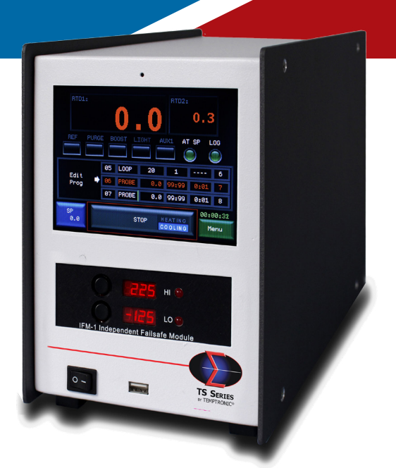
TS Shown with Failsafe Module option

The inTEST Thermal family includes three temperature-related corporations: Temptronic, Sigma Systems, and Thermonics. Products include thermal chambers and plates, portable temperature environments, and process chillers.